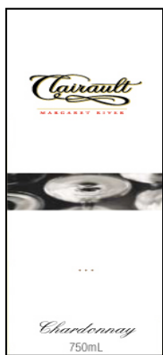
Best in Class - Silver

The International Wine and Spirit Competition is the premier competition of its kind in the world. Its aim is to promote the quality and excellence of the world's best wines, spirits and liqueurs. All wines are blind tasted in groups divided by variety, region and vintage. Technical analysis is carried out on all medal winning wines to ensure that all products are technically sound and will be of the same high quality when they reach the consumer as they were when judging panels originally tasted them.